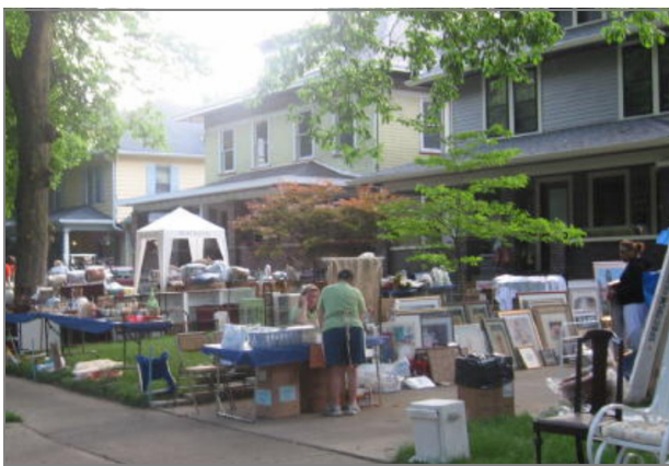
Garage Sale at Woodruff Place

Second Starts receives items every year which are not on our “wish” list of items to donate. These items are cleared from inventory via the annual garage sale. This year’s garage sale took place on June 2 nd and 3 rd at the Woodruff Place Flea Market, which attracted thousands of shoppers. On this one weekend, we raised more than sixty-two hundred dollars! All proceeds from the sale have gone directly back into the operating fund to support our ongoing efforts to provide needed house wares to families starting over after a period of homelessness. A big “THANK YOU” to the SIXTY people who volunteered their time as sales assistants or who helped in the setup and cleanup activities.